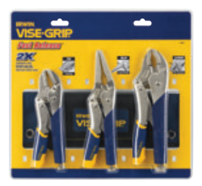
Fast Release Locking Pliers w/ Kitbag (3-piece Set) 76KBT