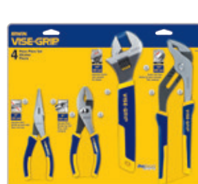
4-piece Pliers and Adjustable Wrench Set 2078705