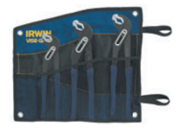
3-piece Waterpump Pliers Set 1805630