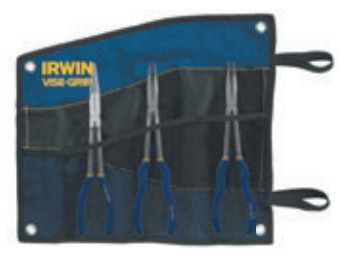
3-piece Long Reach Pliers Set 1799145