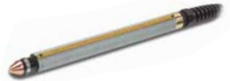
T45m machine torch