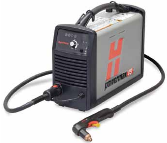
T45v hand torch